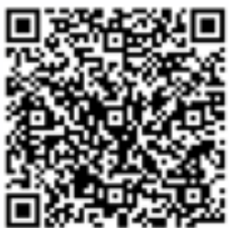
Job Fair Registration QR Code

If you have any questions or need support, please contact the Recruitment and Retention Team at 386-734-7190 x 20115